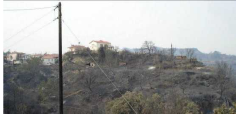
The village of Agia Anna before and after the fires

The Greek Evangelical Church, through the initiative of the Second Ev. Church of Athens, started a ministry called "Symparastasi" (literally: Standing Together). The Peloponnesus Project of Symparastasi includes four phases so far. For a detailed picture documentation and additional information, please visit www.symparastasi.gr